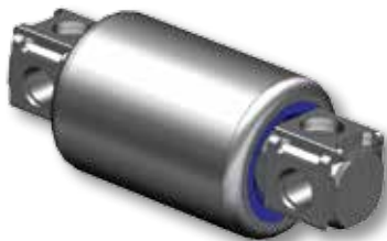
TD5050150L Hendrickson Bar Pin End Bushing