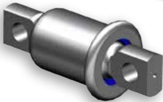
TD46268L Freightliner Airliner Beam Bushing

Current product details and application information can be located at: