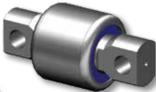
TD839310 Kenworth Air Glide Sway Bar Bushing