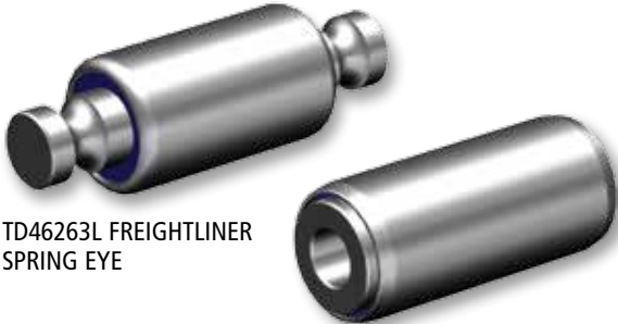
TD46263L FREIGHTLINER SPRING EYE